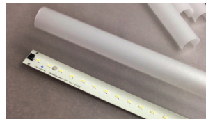
SL21 - Parabolic Snap on Lens Cover

Description: Diffusion installs literally with a snap, with LED Living Technology's new and exclusive snap on frosted strip lenses. Designers will find an increased area of diffusion, as the LEDs and snap on diffuser are mounted directly to the back of the housing, effectively eliminating unsightly dark shadowing.