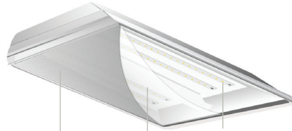
Standard A12 Isotropic Lens LEDs

Description: This .033" thick acrylic film diffuser overlays over existing Prismatic 2x4 A12 lenses. With beam shaping isotropic diffusion, individual LED hot spots are beam shaped into one continuous line for additional eye-comfort.