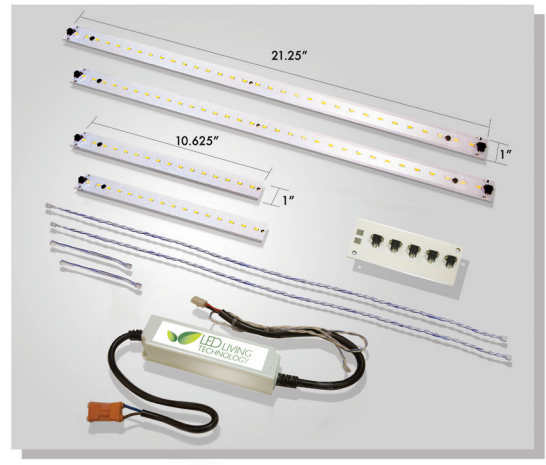
Emergency Battery Pack Ordering Example: CLA-EM10