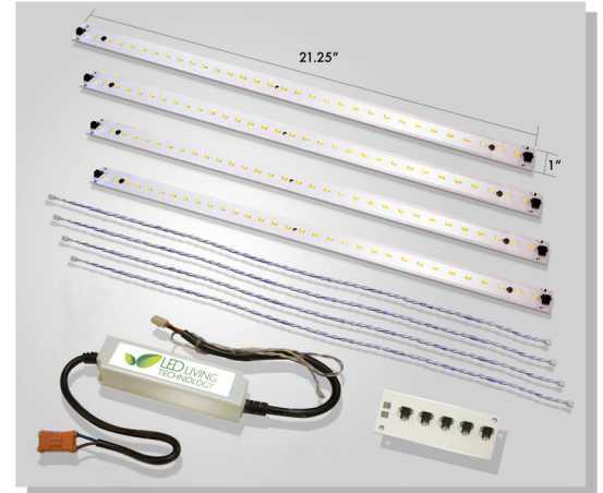
Emergency Battery Pack Ordering Example: CLA-EM10