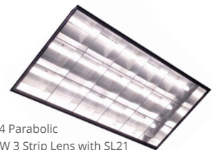
2x4 Parabolic 24W 3 Strip Lens with SL21